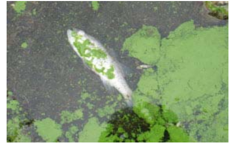
How Too Much Nutrient Pollution Impacts the Chesapeake Bay Ecosystem