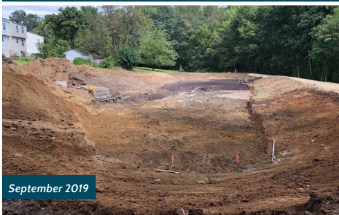
Manor Township Bioretention Basin

Local, state, and federal water quality organizations are funding significant projects in the Chesapeake Bay Watershed and making MS4 permittees in the Chesapeake Bay Watershed a priority. Municipalities are taking advantage of these funding sources to secure money to help construct stormwater projects and achieve required sediment reductions. Listed to the right are some funding successes and the resulting projects.