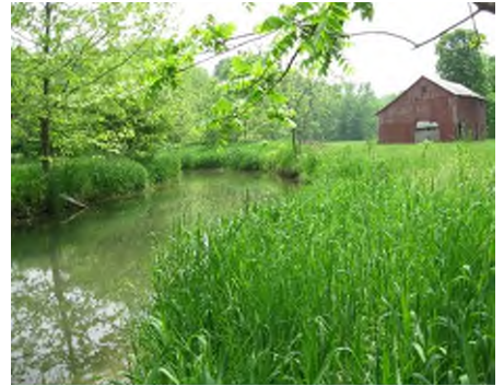
A riparian buffer is located on only one side of the stream. Because of the lack of stream protection, the other side is washing out.